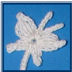
Close up of top

inc = increase work 2 stitches in the same stitch.