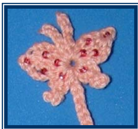
Close up of beaded top